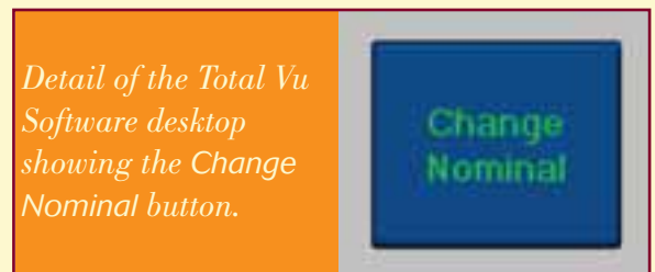
Detail of the Total Vu Software desktop showing the Change Nominal button.